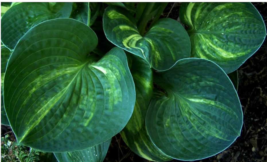
Hosta 'Nantucket' ( 'Christmas Tree Gala' x 'Black Hills' )