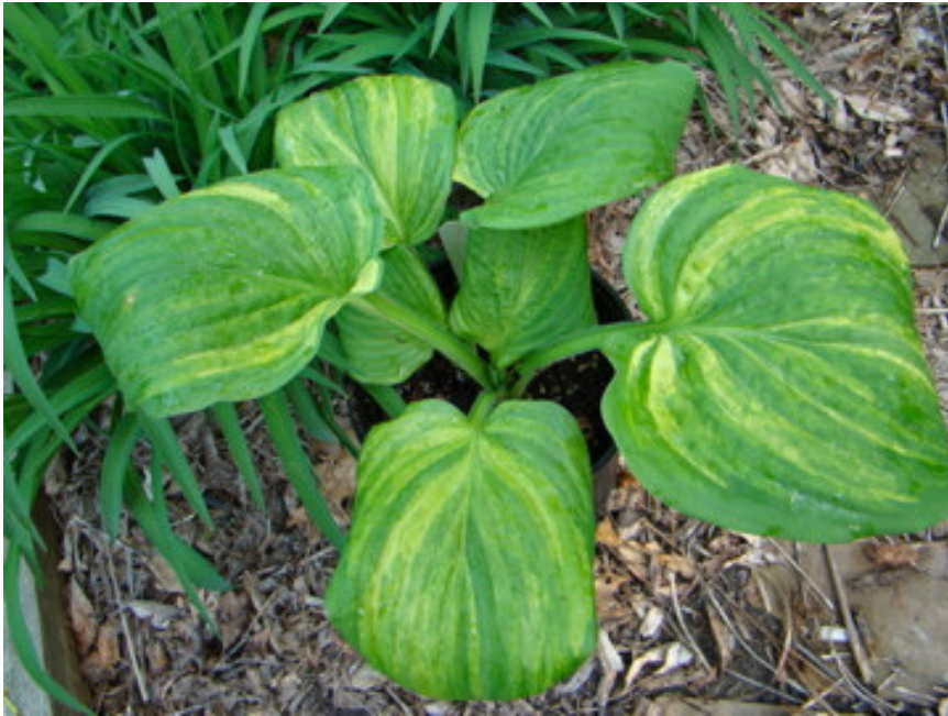
Hosta 'White Angel Supreme' X OP 2006 seedling

http://www.americanhostasociety.org/ahs_auction_awards.html