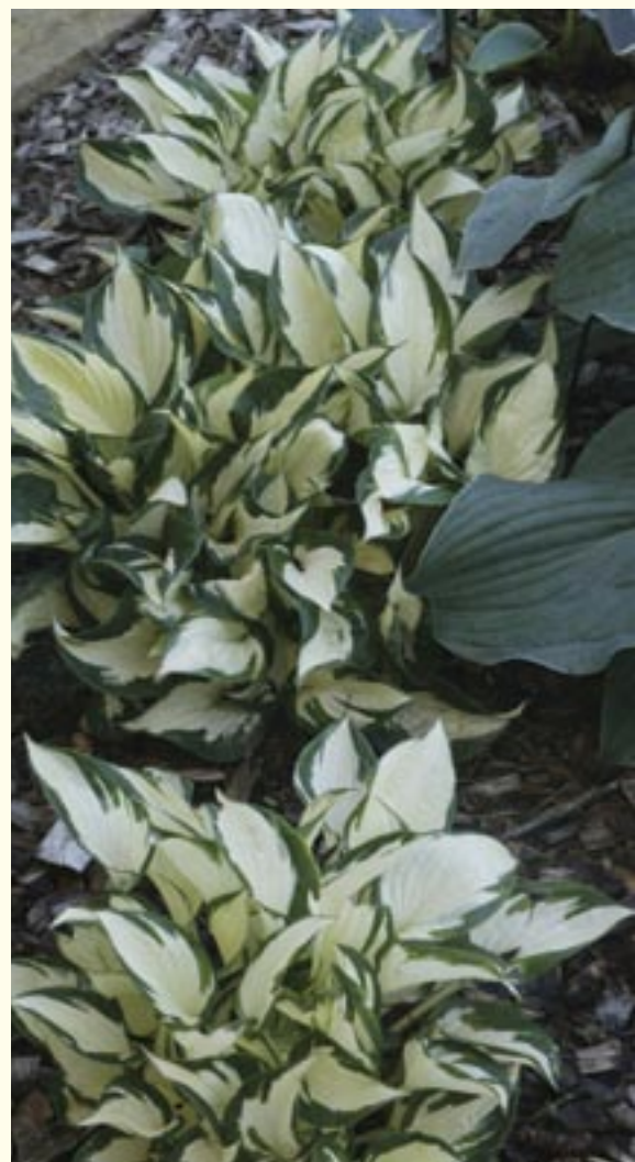
At first glance, these three different cultivars look the same (and maybe at second glance, too). Can you identify them?

The most noticeable of these was the marked change in the habit of 'Fire and Ice' as compared to 'Patriot'. While 'Patriot' possesses flat, roughly heart-shaped, ovate leaves, the leaves of 'Fire and Ice' are more elongated and strongly and consistently twisted. Along with the dramatic change in leaf form, the shape of the plant changed significantly as well. H. 'Patriot' forms a wide, spreading mound of foliage, while 'Fire and Ice' forms a rather compact, upright mound of leaves. A typical clump of 'Patriot' is