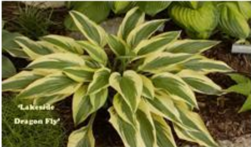
'Lakeside Dragon Fly'