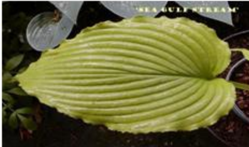
'SEA GULL STREAM'