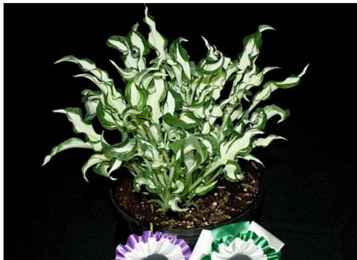
Latest winner Best Sport Attendees & Judges > c \ b ' C D 6 f ] Y b ' G d c f h ' ' < " ' i G b c