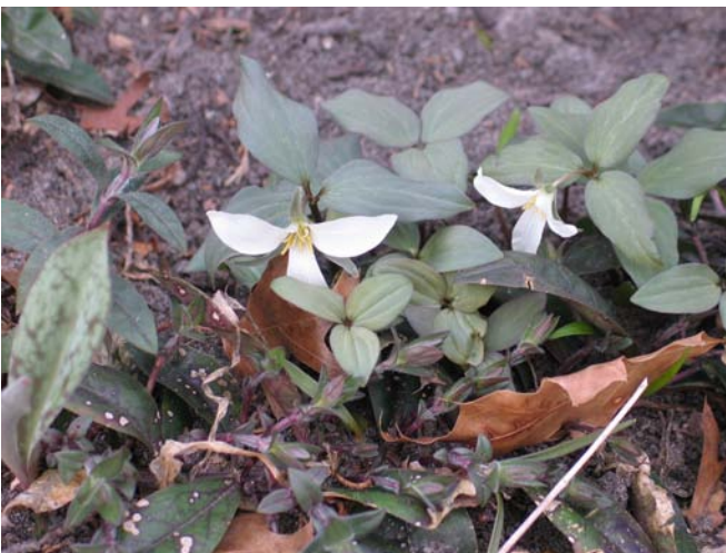
Trillium nivale Snow Trillium

Spring hits me as a long awaited dream each year until unmistakable signs appear, often late for those of us in the northern regions. The first promise of its arrival appears with the miniature Trillium nivale before the snow has totally disappeared. The Snow Trillium are soon followed by the appearance of Dicentra cucullaria with their delicate pastel blooms and Scilla siberica of intense blues that have naturalized nicely amongst the still sleeping hostas and ferns. Clumps of Sanguinaria canadensis 'Multiplex' explode with swaths of chromium white flowers that last better than a week as the first signs of the hosta emerge and all of the dreams of a new season beginning become reality.