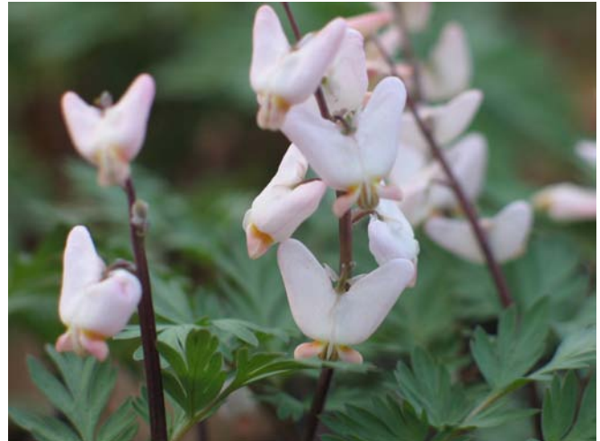
Dicentra cucullaria Dutchman's breeches

Like the gardens, hosta society activity picks up to a much faster pace. Local meetings, sales, service projects, and yes the AHS national convention quickly approaches. This event, like the show displayed by our plants is a must not miss event upon many of our calendars. It is not too late to sign up now. If you have never attended, you are invited to join us for another event that will build memories for years to come. Check out http://www.2015ahsconvention.com/ to learn more.