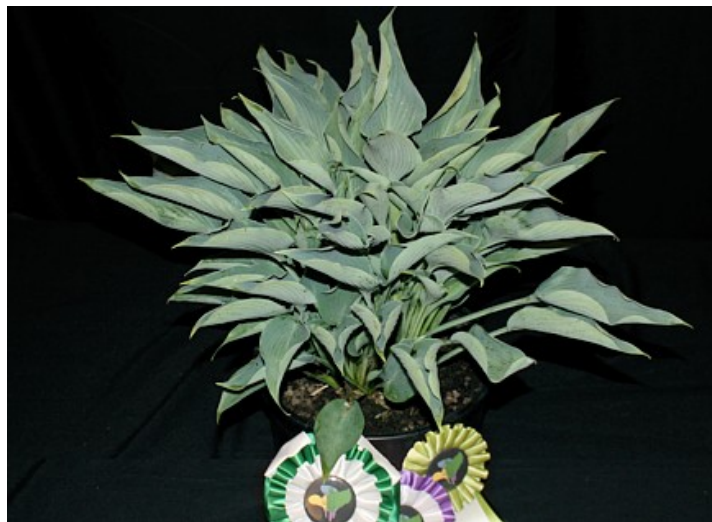
Winner of FL13 Judges Best Seedling ? U h \ ] Y ' G ] g g c b ' G Y Y X ` ] b [ ' ' < " ' i