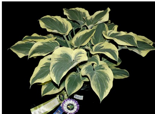
Latest winner of Attendee Best Seedling 7 \ ] W _ ' K U g ] h ] g ' G Y Y X ` ] b [ ' < " ' i @ c

Information and registration forms can be found at : www.hostalibrary.org/firstlook/HomeFrame.htm