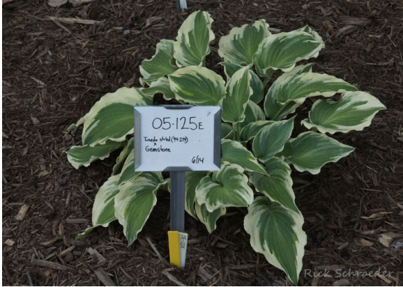
Potential new Hosta