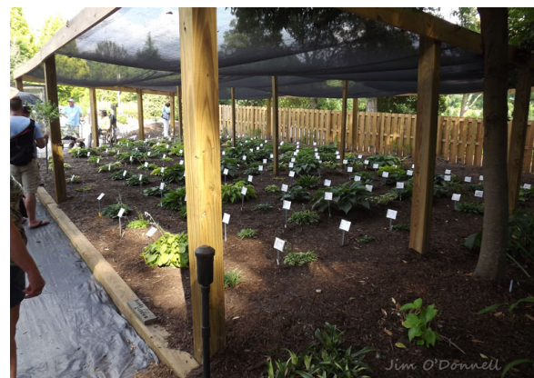
Hosta Growing Area